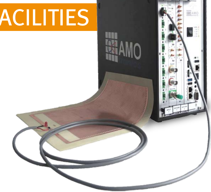
Example: Portable 8-channel fragment test system with make screen power supply and diagnostic features, combined with high-speed analog data acquisition channels in a FlatSaturn unit.

The SATURN digital measurement system for fragment tests and ballistic applications handles up to 192 input channels in one system - either all integrated into one cabinet or split between bunker and test site.