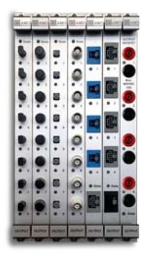
Electrical and fiber optical output interfaces

degree of flexibility. The exact high/low level definition for the analog input offers additional pulse generation options.